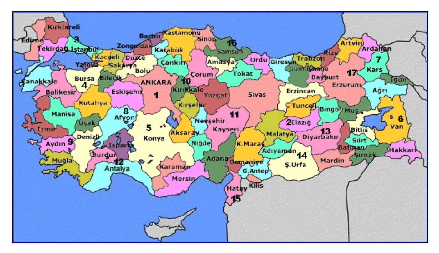
Figure 1 – The 17 Turkish Faculties of Veterinary Medicine are represented in each respective region. The numerical order refers to the timely fashion in which each University established its Veterinary Faculty.

were hosted in the Hospital building for some time. An impressive set of 4 specular building was then completed in 2010, which now hosts all departments except for the clinical ones. The ADU comprises a total of eleven faculties of which 6 are fully established (Agriculture, Medicine, Veterinary Medicine, Nazilli Economics and Administrative Sciences, Science and Literature, Education) and others are only formally established (teaching has not started yet) or have started teaching activities in a temporary location (Dentistry, Communication, Engineering, Aydın Economics and Söke Economics). The ADU features also six 4-year vocational schools (Health, Sports, Tourism, Foreign Languages and Practical Applications).